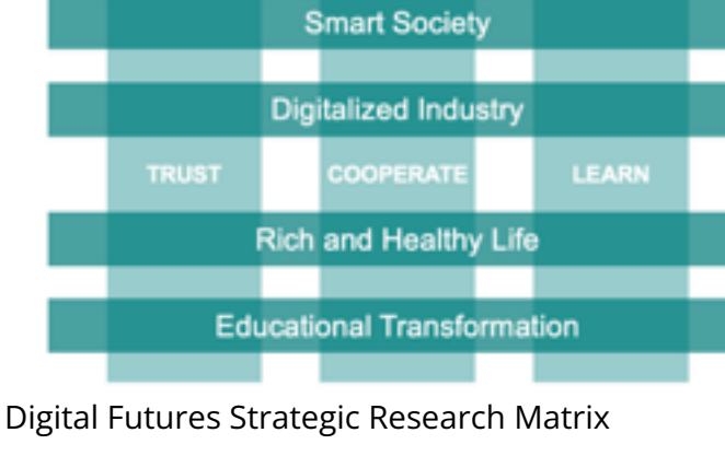
Open call: Second Call for

Research Pairs Projects in Technologies for a Digital Transformation Digital Futures wants to facilitate