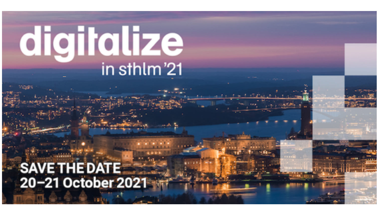
Digitalize in Stockholm is an annual conference and meeting place for global thought